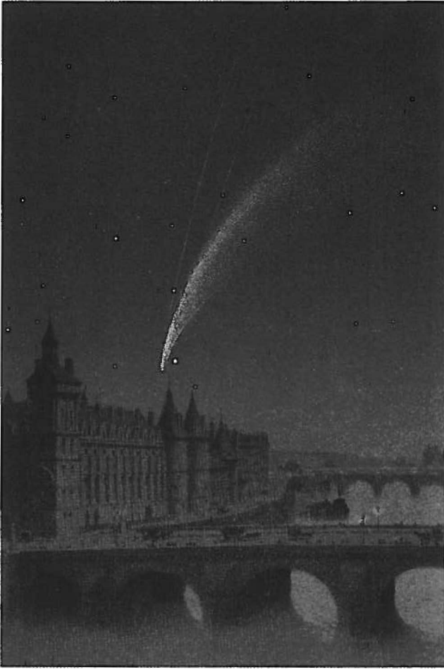
Figure 1. Donati's comet, shown over Paris on October 5, 1858. (A. Guillemin, Le Ciel , 1877).