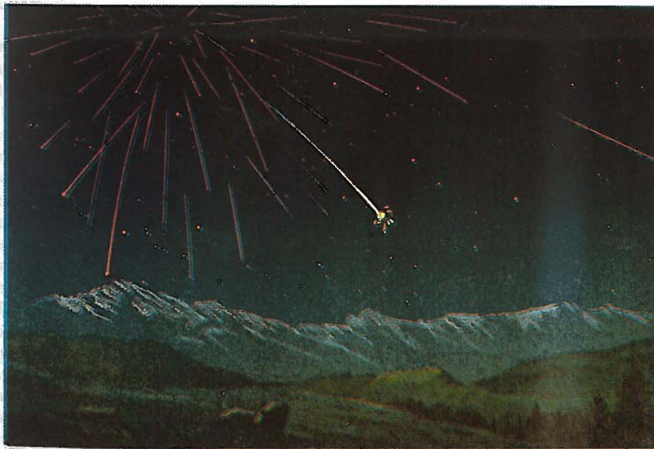
Figure 3. A meteor shower, from a nineteenth century drawing. (A. Guillemin, Le Ciel , 1877; Observatoire de Paris, photo Council).

Note in passing that the smallest dust grains are in fact spread throughout the entire solar system and are ultimately lost to it; the heaviest will be distributed along orbits which follow approximately the comets which were their sources. If these latter orbits happen to cross that of the Earth, the particulate matter will at regular intervals enter our atmosphere and give rise to meteor showers (as shown dramatically in Figure 3). On the other hand, the smallest grains, which are everywhere, will tend to be swept up continuously by the upper layers of the terrestrial atmosphere, where they can be collected by high flying aircraft (and orbiting space platforms) for