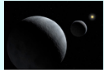
ESO PR Photo 02a/06 Artist's Impression of the Pluto Charon system

An accurate timing of the occultation seen at the three sites provides the most accurate measurement of Charon's size: its radius is found to be 603.6 km, with an error of the order of 5 km.